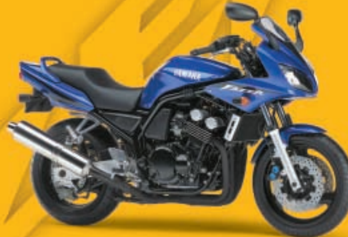
DPBMC (Deep Purplish Blue Metallic C)