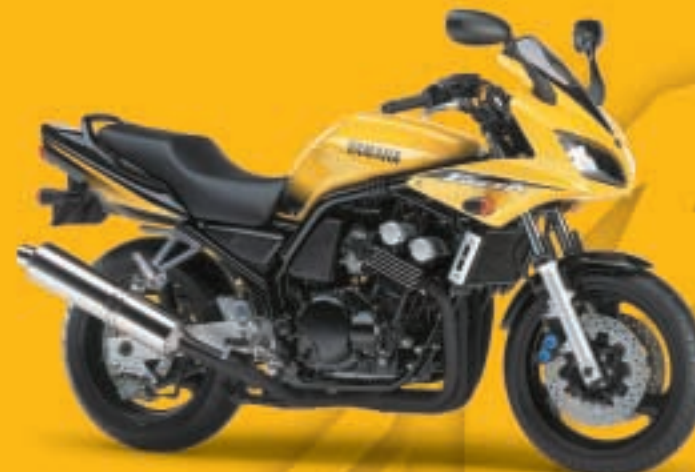
RYC1 (Reddish Yellow Cocktail 1)

Always wear a helmet, eye protection and protective clothing. Yamaha encourage you to ride safely and respect fellow riders and the environment. Specifications and appearance of Yamaha products shown here may vary according to requirements and conditions, and are subject to change without notice. For further details, please consult your Yamaha dealer.