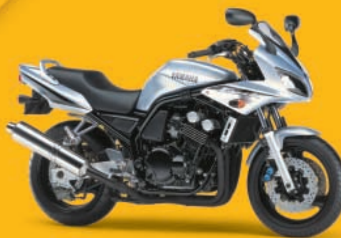
S1 (Silver 1)