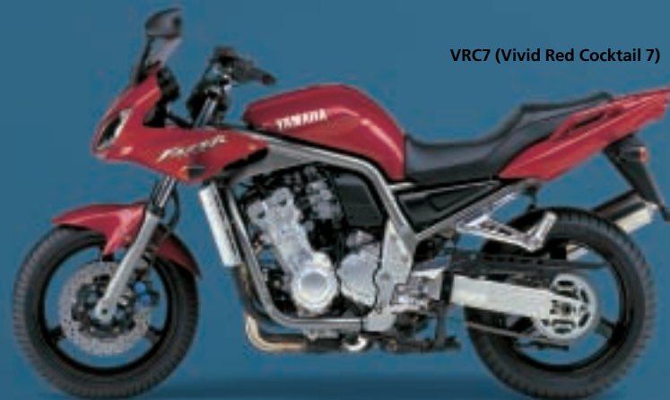
VRC7 (Vivid Red Cocktail 7)