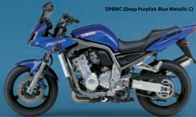
DPBMC (Deep Purplish Blue Metallic C)