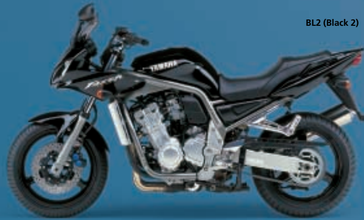
BL2 (Black 2)